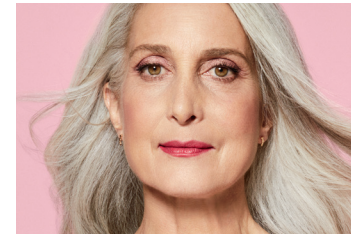
Model has deep-set eyes and square-shaped face.